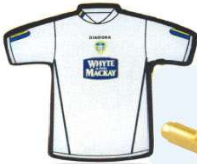
PM 371 / 51 g