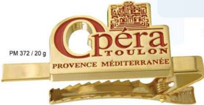
PM 372 / 20 g